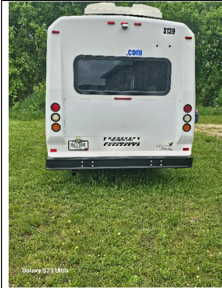
Galaxy S23 Ultra