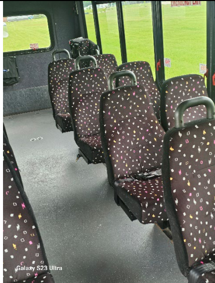
Galaxy S23 Ultra