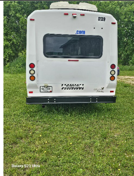
Galaxy S23 Ultra